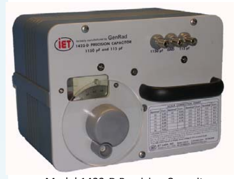
Model 1422-D Precision Capacitor

The 1422 is a stable and precise variable air capacitor intended for use as a continuously adjustable standard of capacitance. One of the most important applications is an AC bridge measurements, either as a built-in standard for substitution measurements. It is available in a variety of ranges, terminal configurations, and scale arrangements to permit selection of precisely the required characteristics.