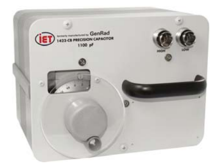
Model 1422-CB/CL Precision Capacitor