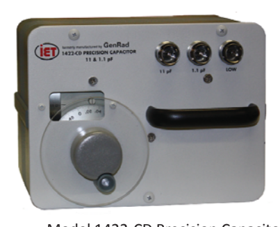
Model 1422-CD Precision Capacitor

Two-terminal - The 1422-D is a dualrange 115 pF and 1150 pF, two-terminal capacitor, direct reading in total capacitance at either range terminal to ground.